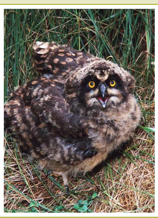
Short-eared owl

important role in conserving many diverse species and habitats, both resident and migrant, common and rare. For example, the Commonwealth's expansive hardwood forests, which cover 62% of the landscape, provide critical wildlife habitat for abundant white-tailed deer and an array of neotropical migrant songbirds.